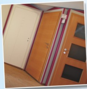
WOOD SUBSTITUTE DOORS

As a wood substitute makes weather-resistant doors and panels.