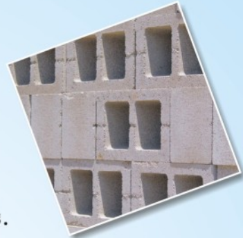
FLY ASH BLOCKS

Makes a wide variety of strong and durable finishing Building materials.