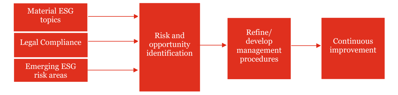
Figure 2: Process flow for ESG risk and opportunities assessment

The process flow for ESG risks and opportunities assessment is described in Figure 2 below: